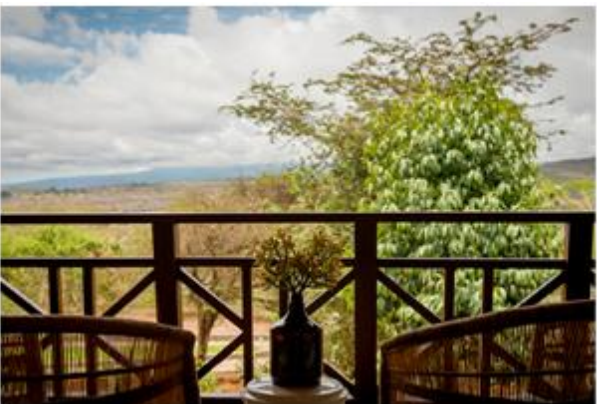
Fri 08 NGORONGORO CRATER B L D

Today enjoy a full day tour to Ngorongoro Crater with lunch.