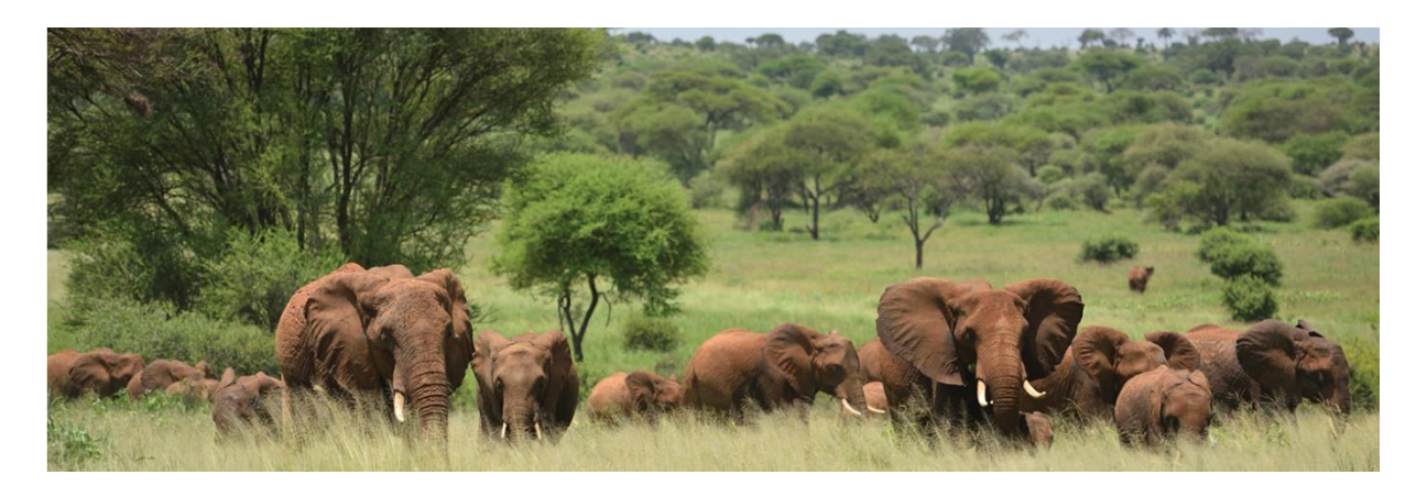
Thu 07 SERENGETI NATIONAL PARK > NGORONGORO CONSERVATION AREA (B)(L)(D)

vantage points for predators. The lion are abundant, the leopard are plentiful (yet still secretive) and black rhino and cheetah both breed here. There are more than 500 species of bird and, interestingly, 100 sub-species of dung beetle - a sign of a varied animal population! Ndutu, in the south, has small lakes where you may see hippo and water birds. Perhaps one of the best ways to see the Serengeti is a hot air balloon ride when, in the cool of the early morning, you may admire the grandeur, the vastness and the stunning landscape.