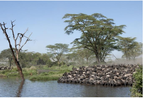
The vast, flat central plains, made fertile by the ashes of the volcanoes of the Ngongoro highlands. This is a place of huge skies, of shimmering heat hazes, yet also of delicate wild flowers blooming after the rains. The savannah, sprinkled with Acacia Tortilis, has majestic termite mounds and rock formations called kopjes which make great